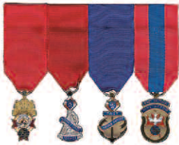
Diagram 4 Former District Master Former District Deputy Past Grand Knight Past Faithful Navigator