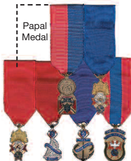
Diagram 7 Papal Medal Past State Deputy Former Vice Supreme Master Former District Master Former District Deputy Past Grand Knight Past Faithful Navigator