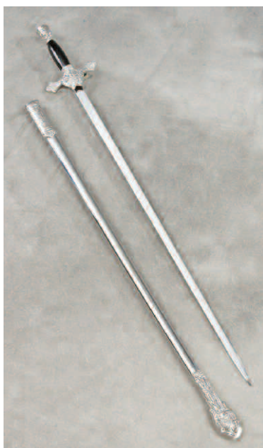
Black Handled Sword with Scabbard