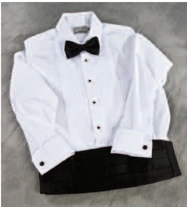
White Pleated Tuxedo Shirt with a Straight Collar With Studs and Cuff Links