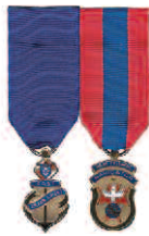
Diagram 2 Past Grand Knight Past Faithful Navigator