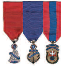
Diagram 2 Former District Deputy Past Grand Knight Past Faithful Navigator