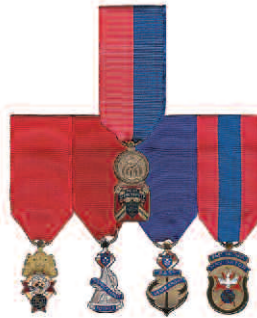
Diagram 5 Past State Deputy Former District Master Former District Deputy Past Grand Knight Past Faithful Navigator